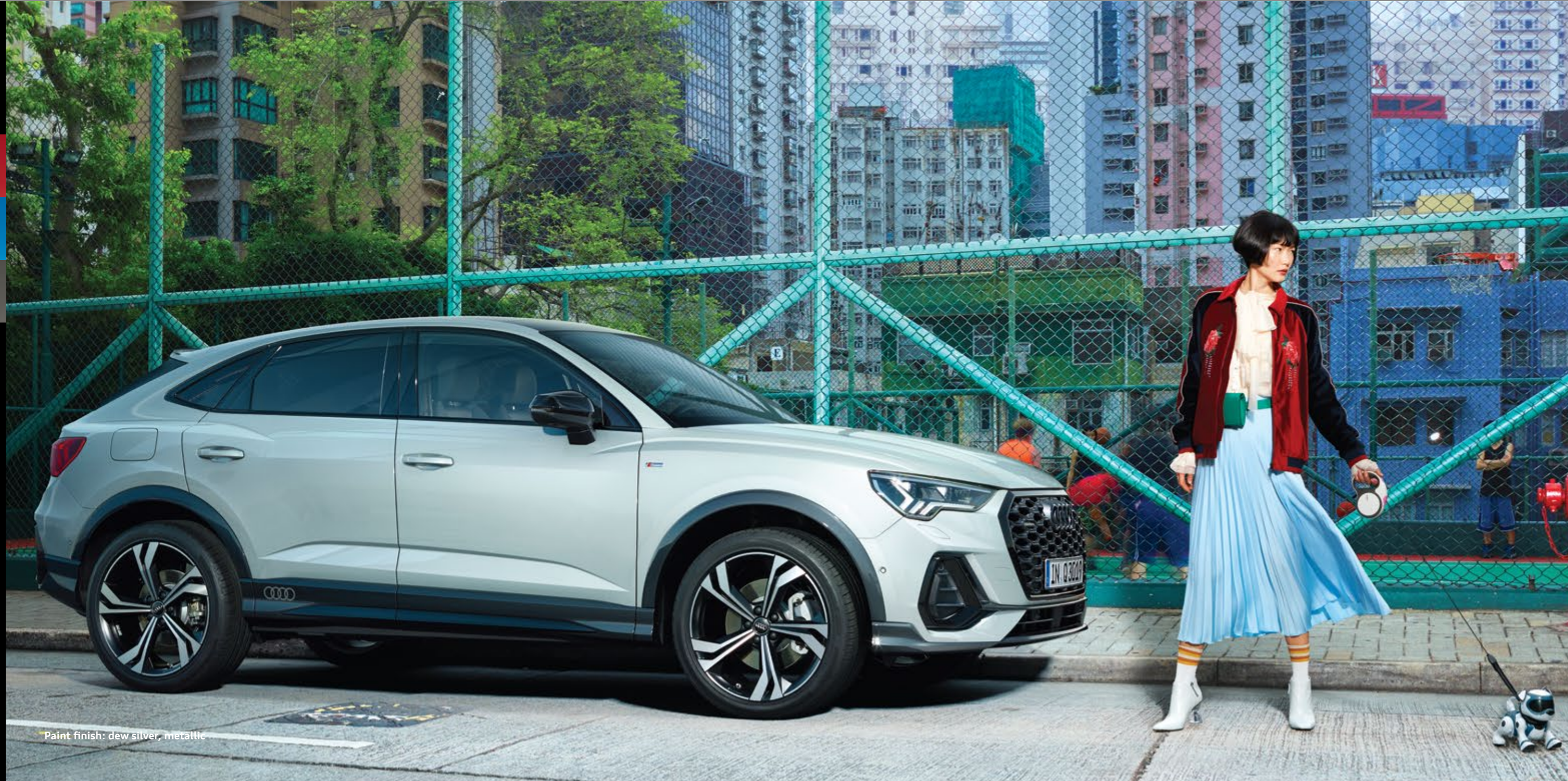
Paint finish: dew silver, metallic

Wild. Colorful. Loud. Exciting. The big city has many facets and never stands still. Just like the new Audi Q3 Sportback. With its extrovert design, it confidently rises to any challenge. Inspired by the legendary Audi Rallye spirit, this sporty progressive SUV coupe combines plenty of fun at the wheel with superb everyday usability. So it doesn't matter what city life means for you and what you are planning to do today: the new Audi Q3 Sportback is ready for anything.