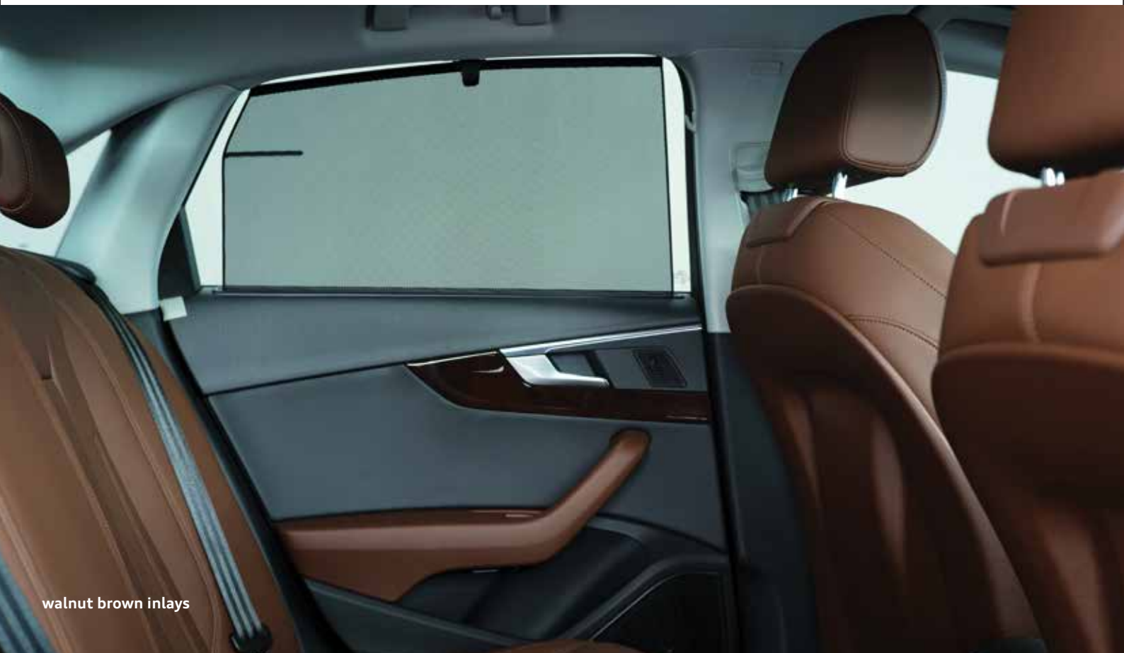
walnut brown inlays