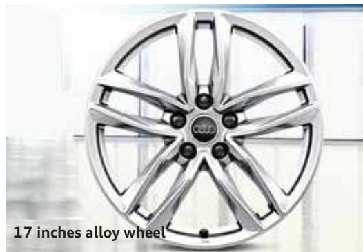
17 inches alloy wheel