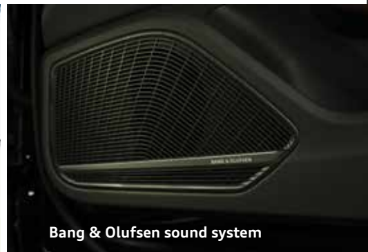
Bang & Olufsen sound system