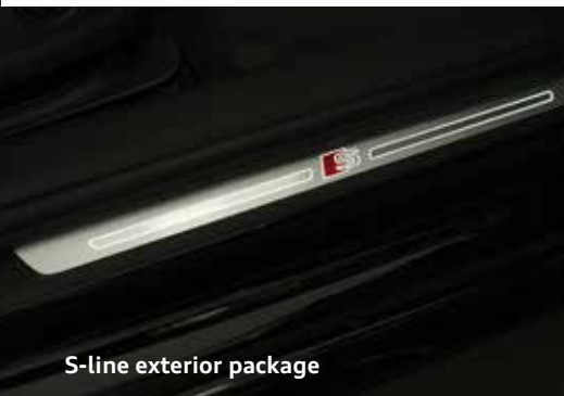
S-line exterior package